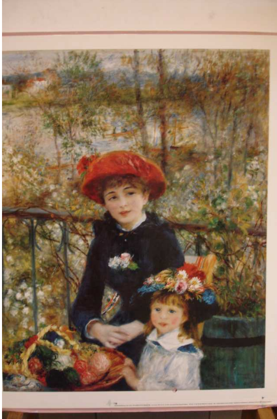
Pierre Auguste Renoir "Two Sisters"